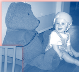
Kasey and Bear never run out of things to talk about...