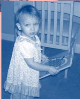
Rose finds a good read at the House!