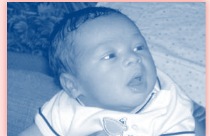
...and London has a lot to say, too!