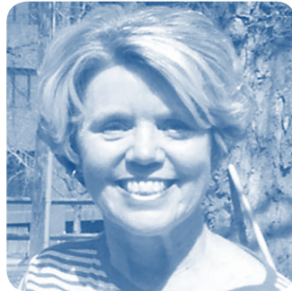
House CAROLYN BLAKLEY