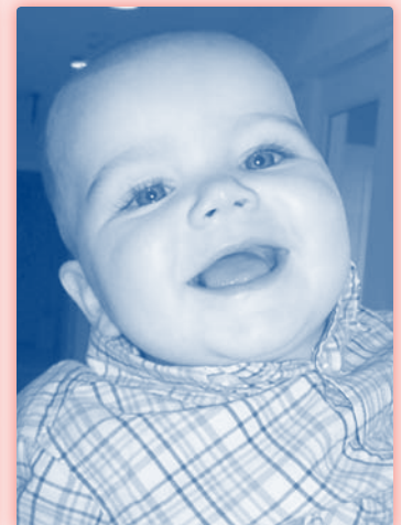
Ashton checks out the House.