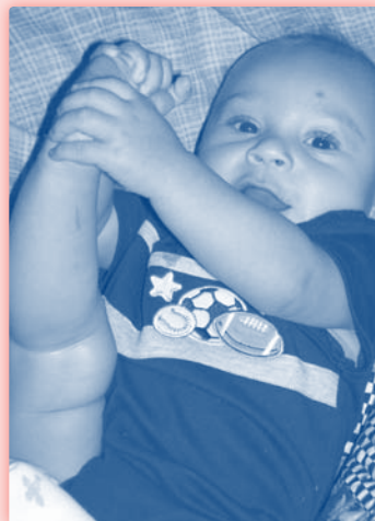
Rashun prepares for the "toes in mouth event!"