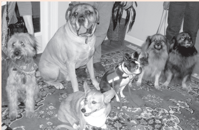
Our cadre of 4-legged volunteers can be counted on to lend a helping paw or two!